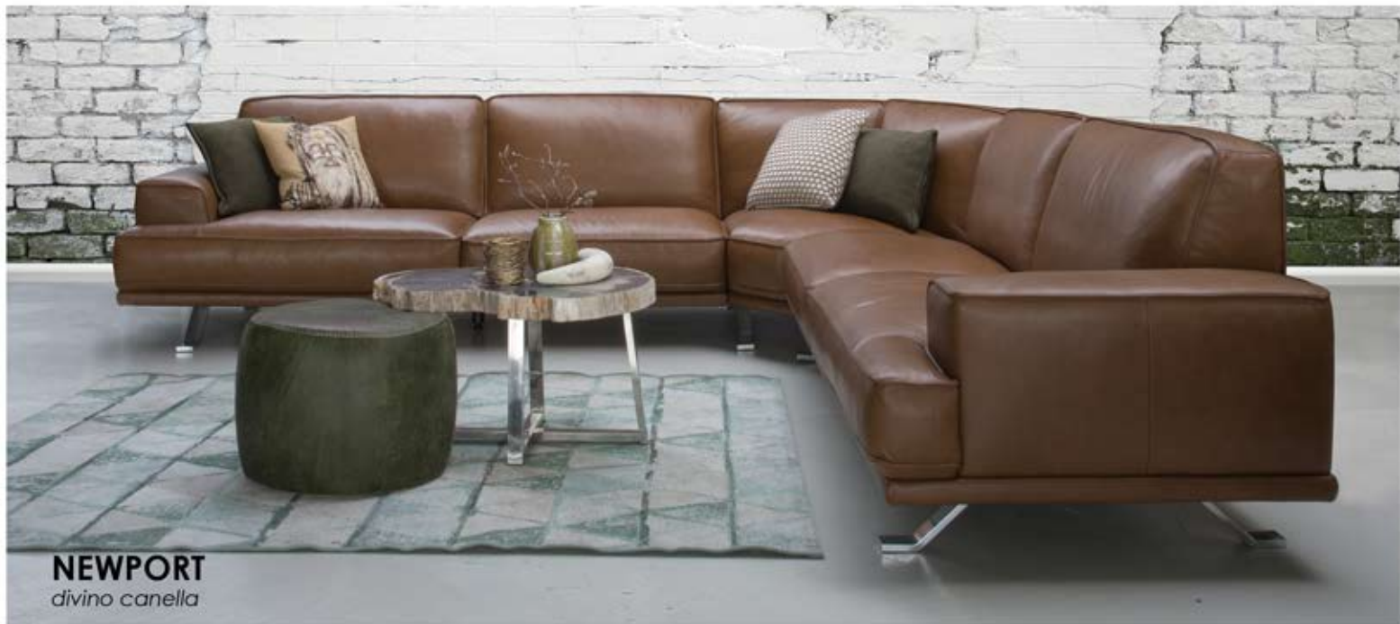
NEWPORT divino canella