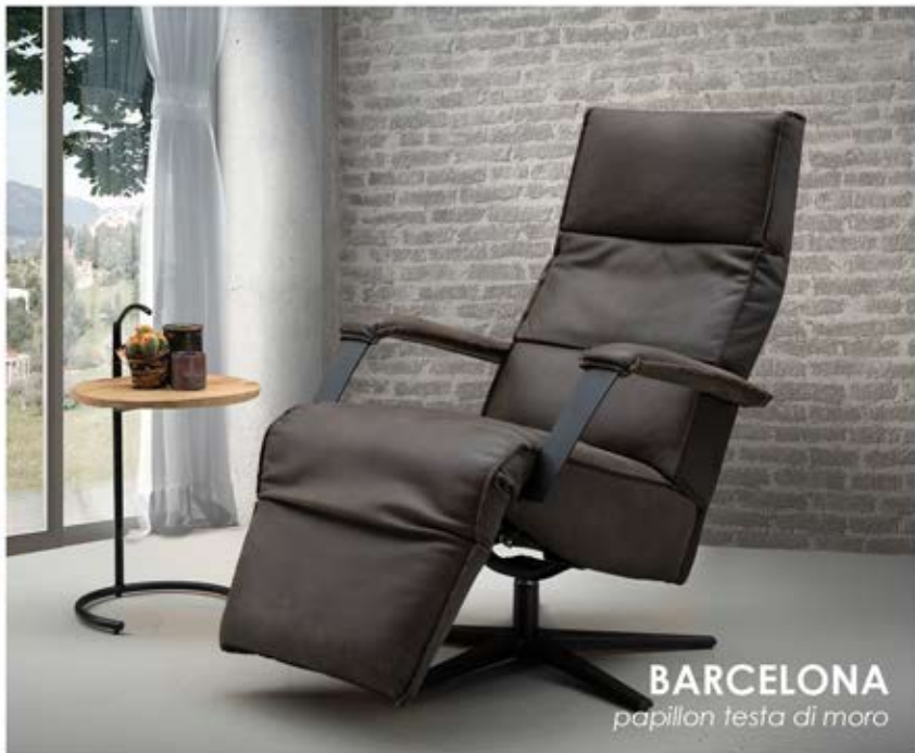
BARCELONA papillon testa di moro