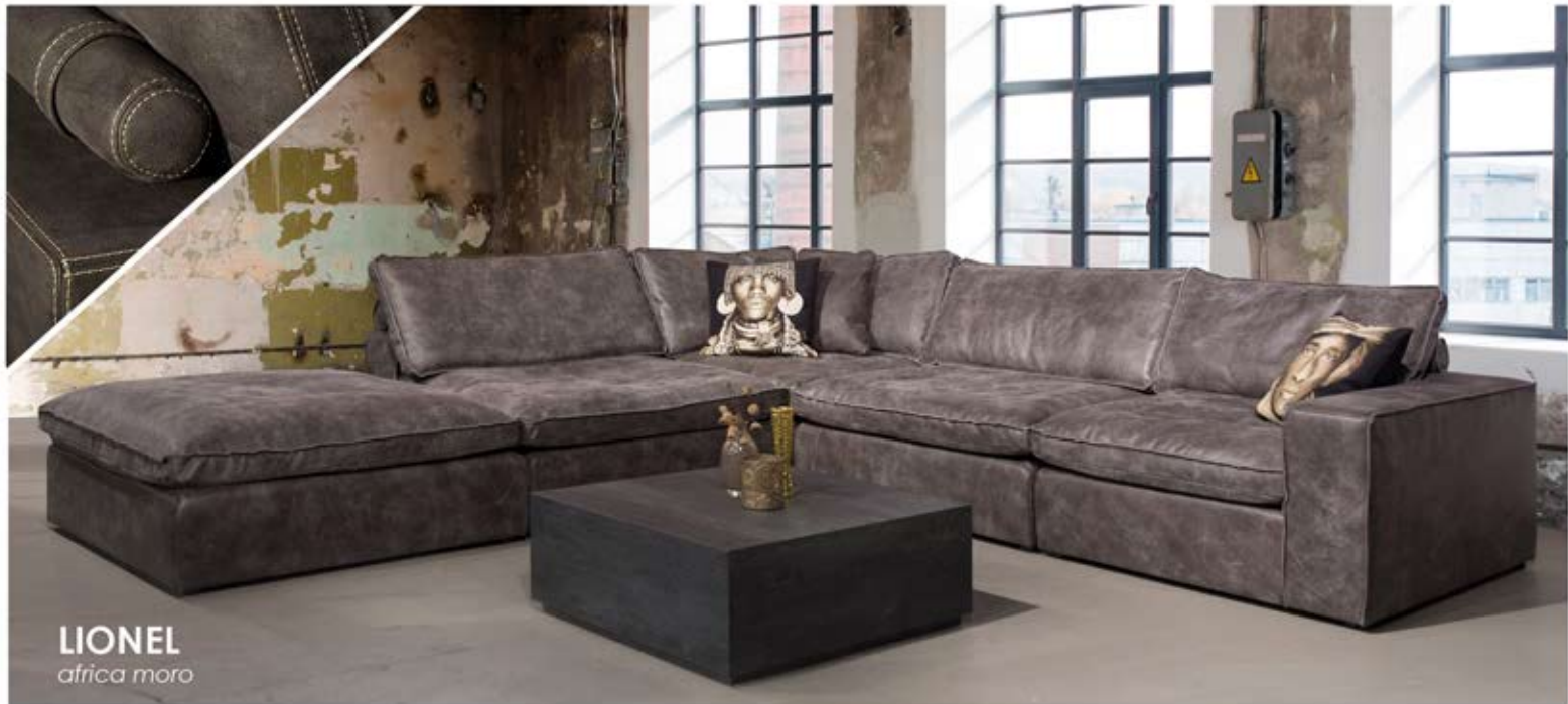
LIONEL africa moro