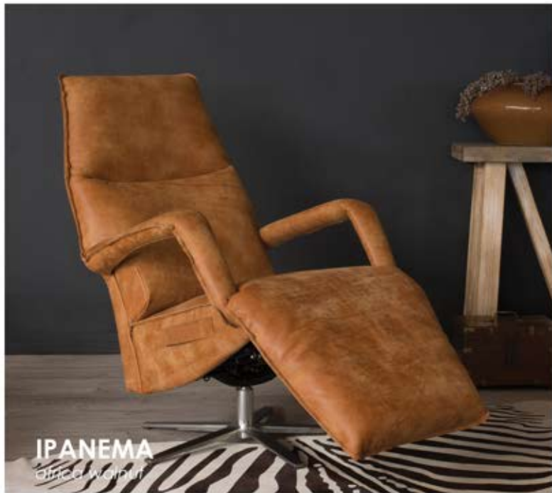
IPANEMA africa wabur