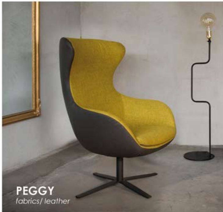
PEGGY fabrics/ leather