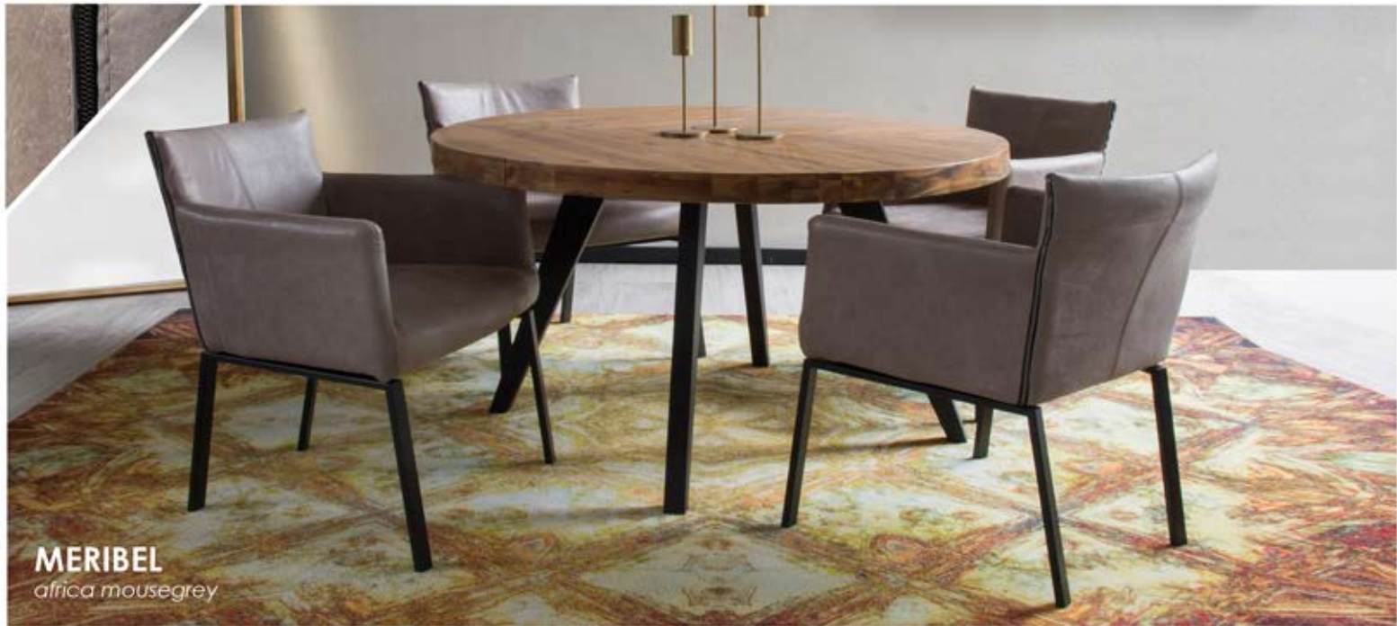
MERIBEL africa mousegrey