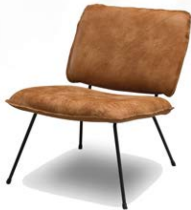
CARAMBA africa walnut