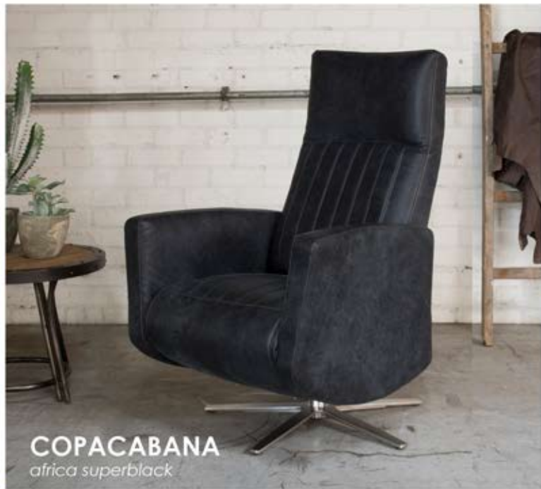
COPACABANA africa superblack