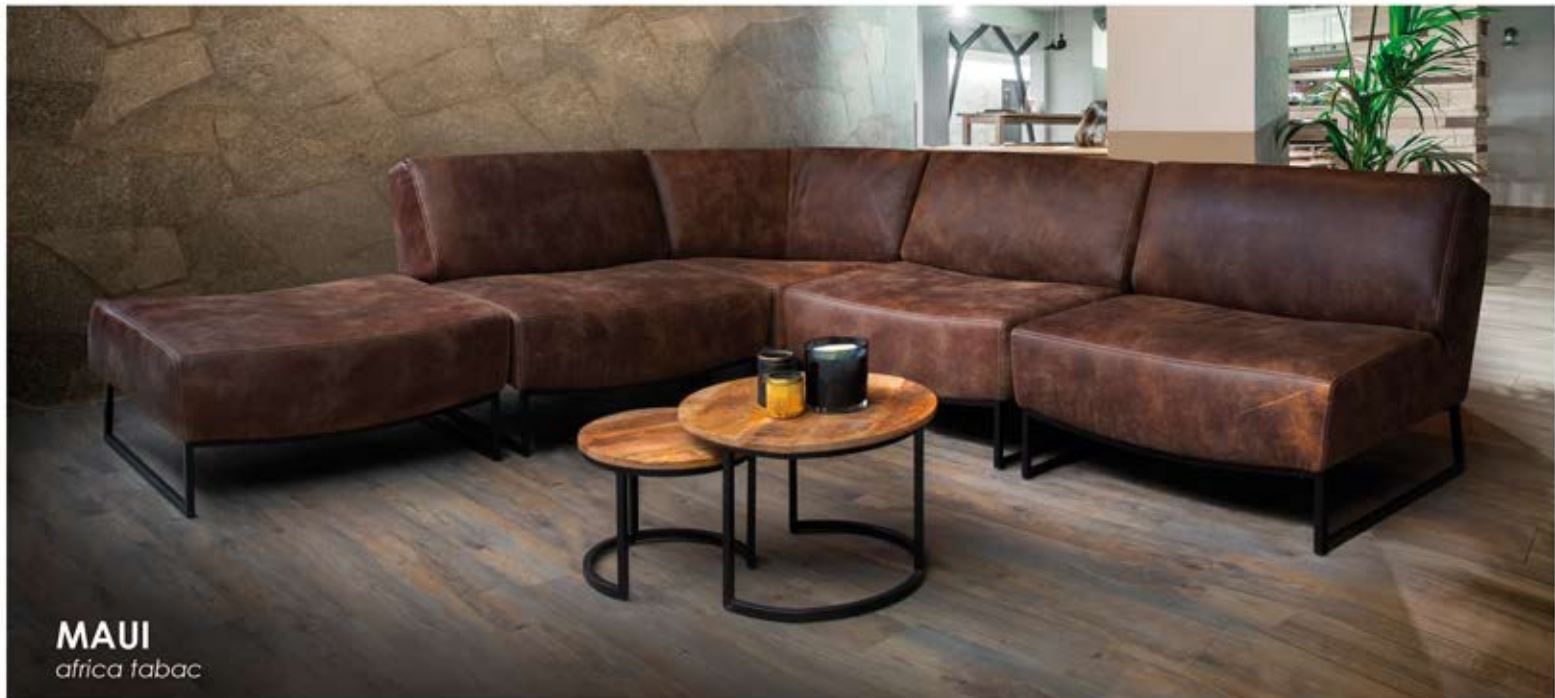
MAUI africa tabac