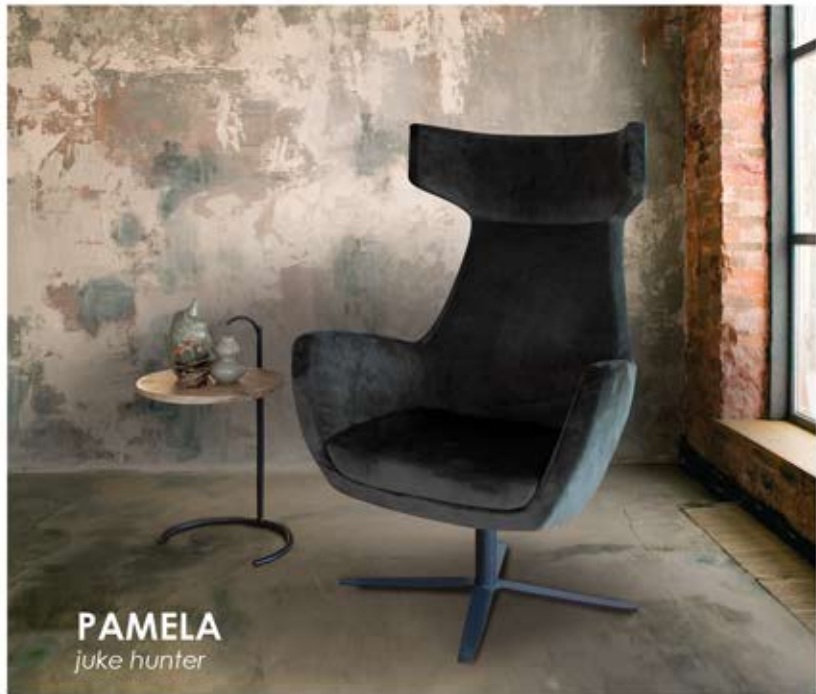
PAMELA juke hunter