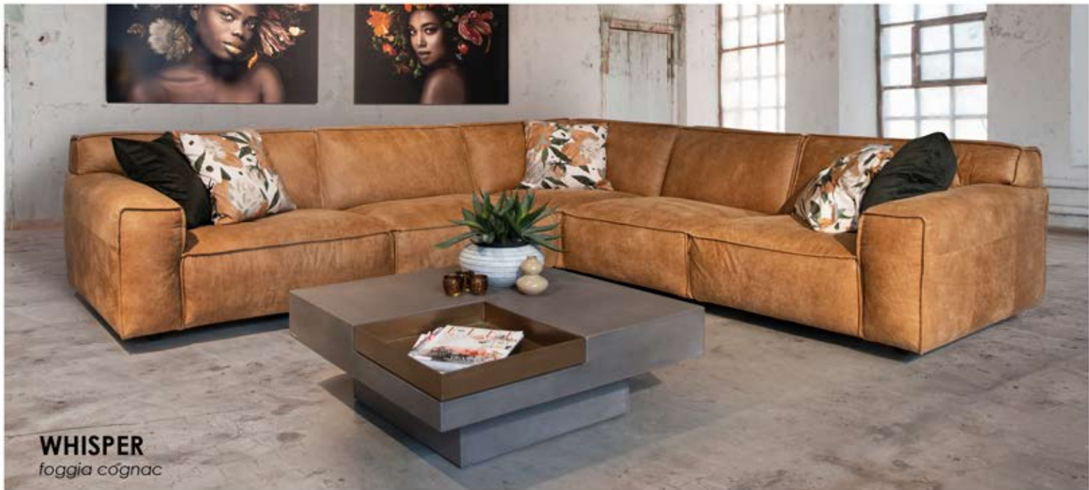
WHISPER foggia cognac