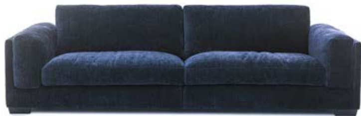
INDIANA bodega navy 49