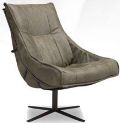
MARCUS africa olive