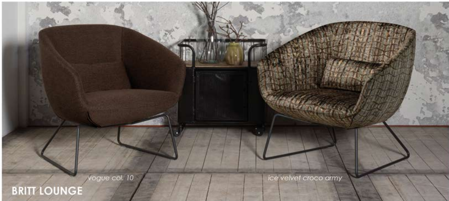
vogue col. 10