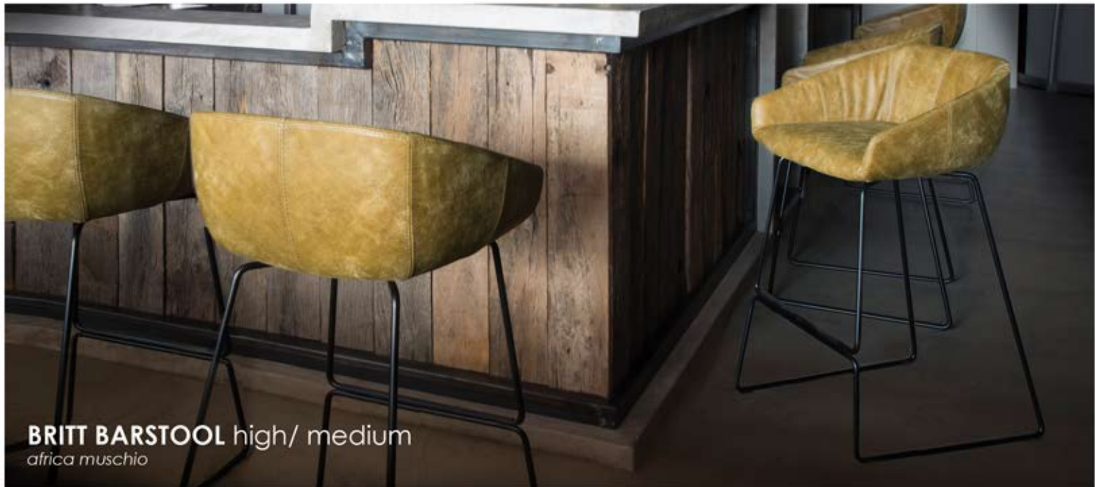
BRITT BARSTOOL high/ medium africa muschio