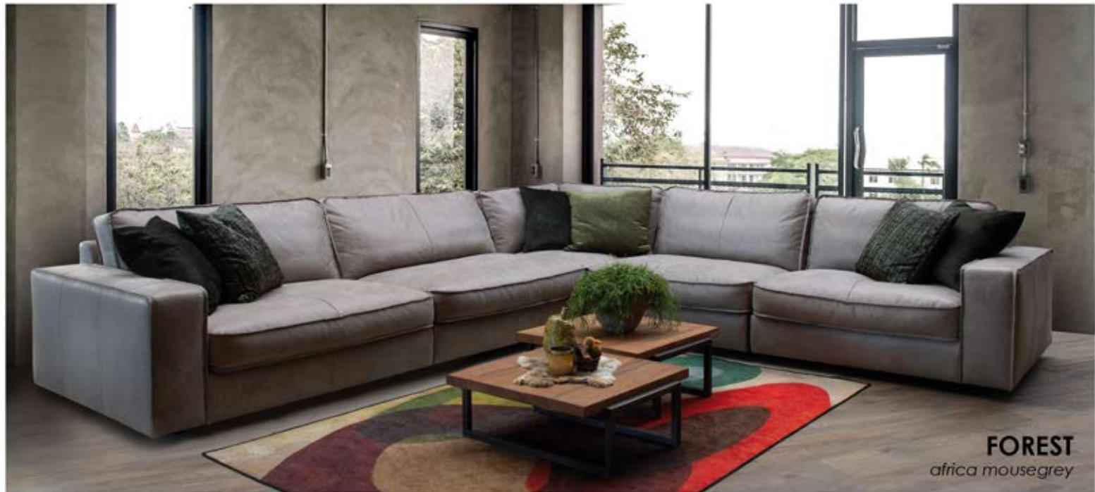
FOREST africa mousegrey