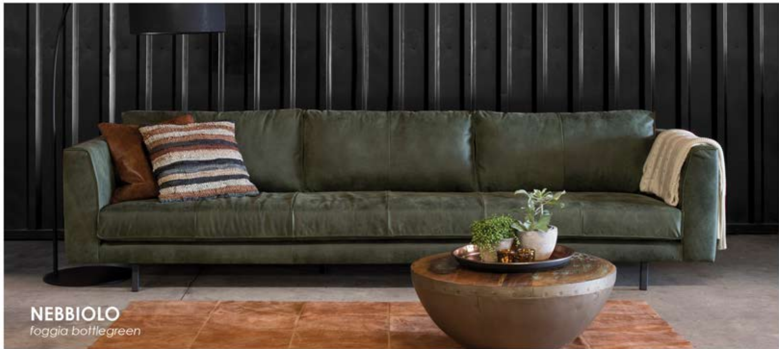
NEBBIOLO foggia bottlegreen