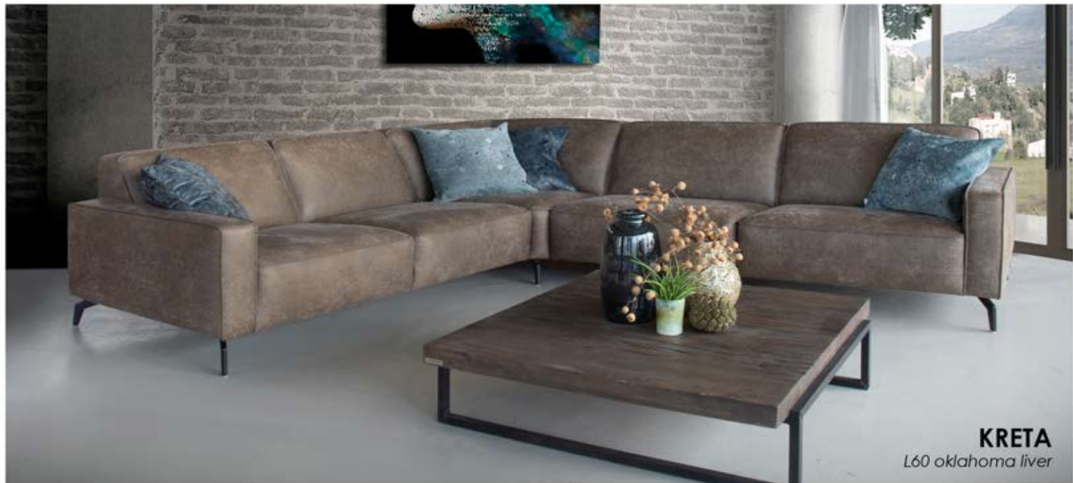
KRETA L60 oklahoma liver