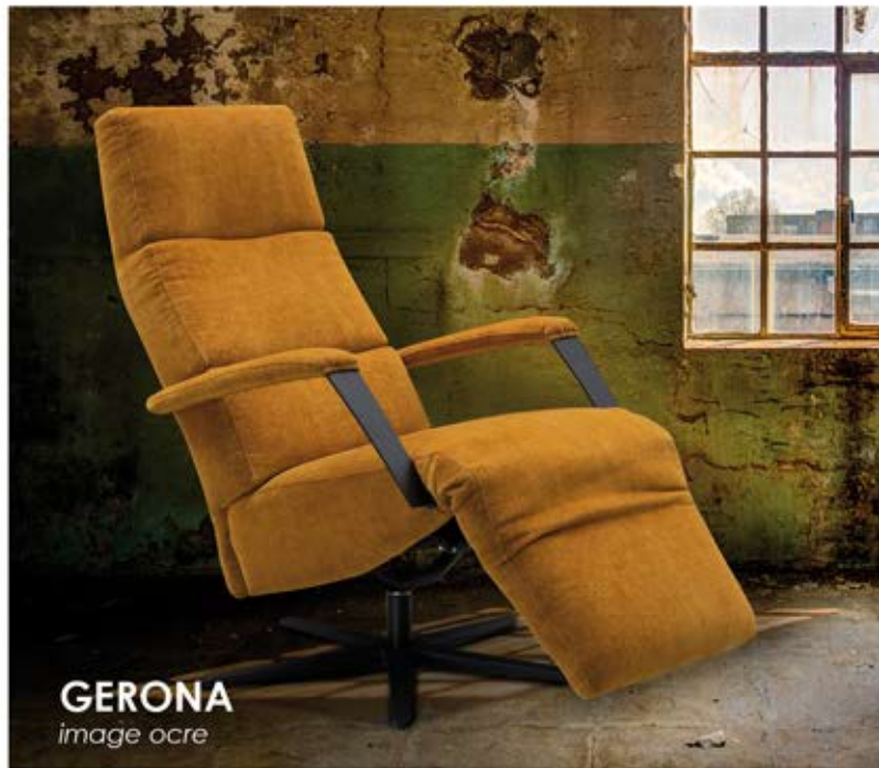
GERONA image ocre