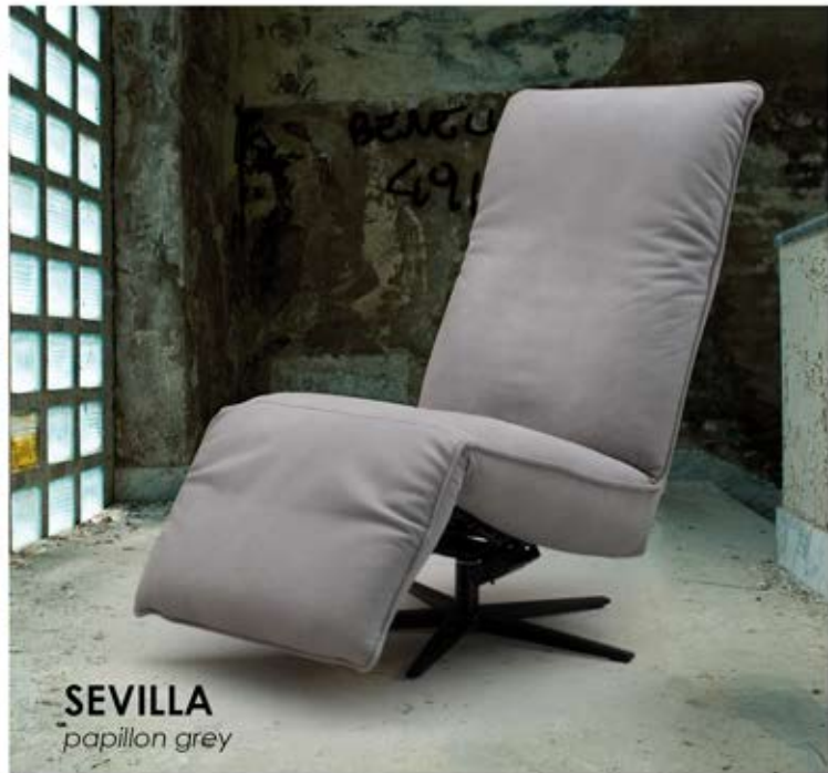
SEVILLA papillon grey