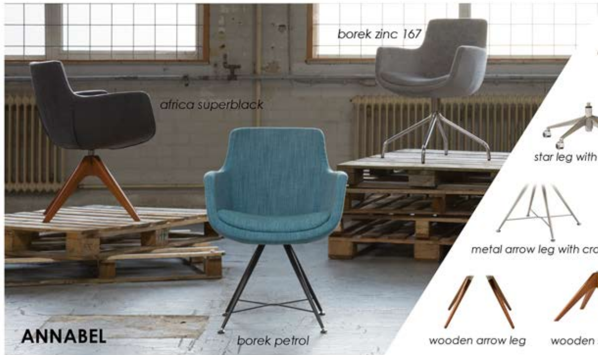
borek zinc 167