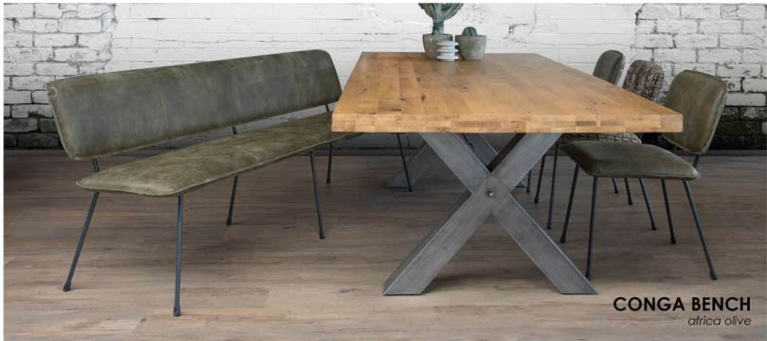
CONGA BENCH africa olive