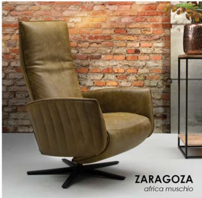
ZARAGOZA africa muschio