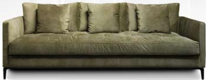
CHESTER vintage velvet dry moss