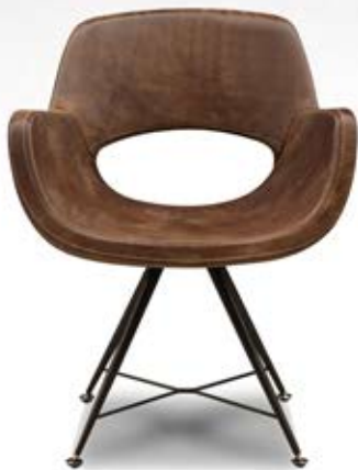
KARIN africa tabac