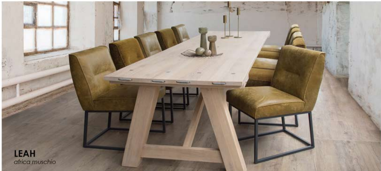
LEAH africa muschio