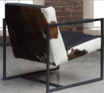
africa superblack / cowskin