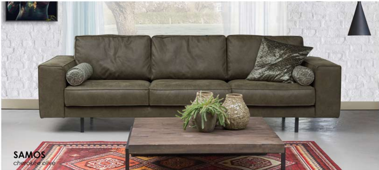
SAMOS cherokee olive